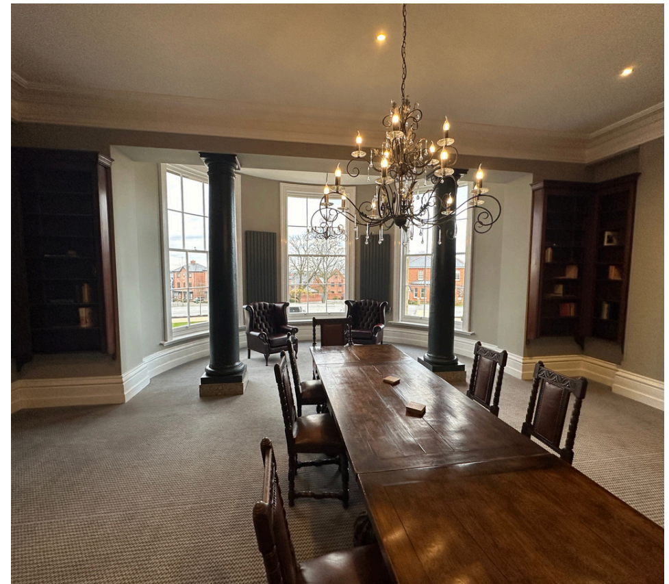
Upper ground floor

Money Laundering Regulations require Savills to conduct checks upon all purchasers/tenants. Prospective purchasers/tenants will need to provide proof of identity and residence.