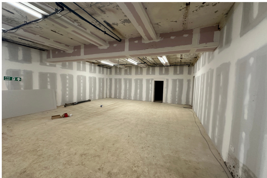
Lower ground floor