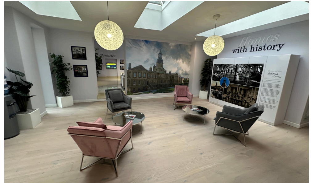
Upper ground floor