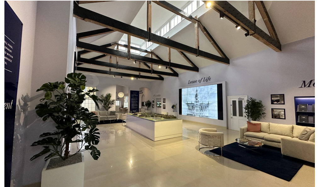
Upper ground floor

Internal floor plans and car park plans are available upon request.