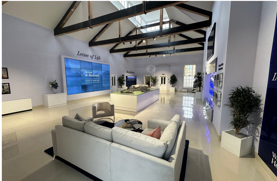
Upper ground floor