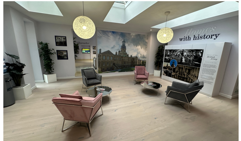
Upper ground floor